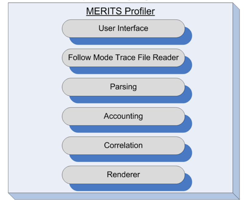
Figure 1: Components of the MERITS Profiler